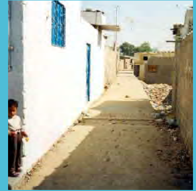
AFTER: The same lane after residents have put in drains, underground sewers and paving.

Somsook: Even if you have very good collective infrastructure, though, the market will still come in and push people out if they don't own the land collectively. And that is what we see happening in cities like Karachi now.