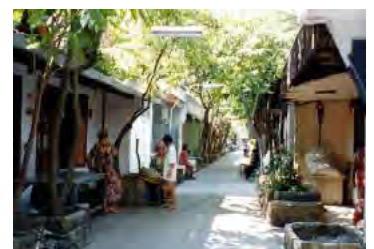
Before and after photos of a kampung in Surabaya that was improved under KIP.