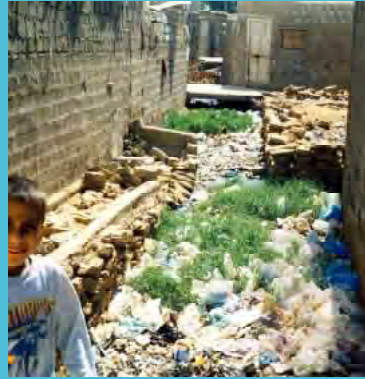
BEFORE: A lane in Orangi Town before the collective infrastructure was put in.

Younus: When we talk about collective housing, we understand that to mean housing in which the land is owned collectively, and the houses and infrastructure are designed and built collectively. In Pakistan we don't have the collective land or collective housing yet. But we do have the collective infrastructure. Since 1980, thousands of informal communities have built their infrastructure collectively, with assistance from the Orangi Pilot Project - 147,000 families in 11,000 lanes in Karachi alone. The OPP provides technical support, but people build and pay for their own low-cost underground sanitation systems themselves. This has happened all over the country, in 30 cities. The communities in Pakistan have also found ways to collectively address livelihood, education and health needs in their settlements.